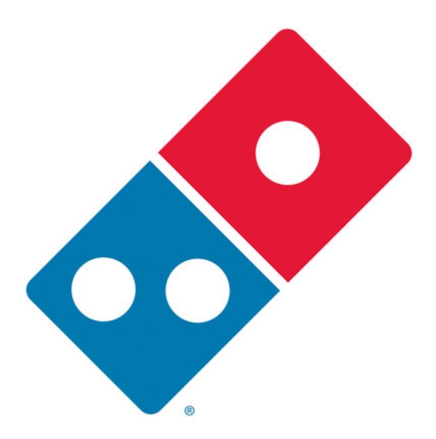
Photo - http://photos.prnewswire.com/prnh/20161007/416524 Logo - http://photos.prnewswire.com/prnh/20120814/DE55948LOGO-b

To view the original version on PR Newswire, visit: <a href="http://www.prnewswire.com/news-releases/dominos-presidential-election-prediction-pizza-wins-300341375.html">http://www.prnewswire.com/news-releases/dominos-presidential-election-pizza-wins-300341375.html</a>