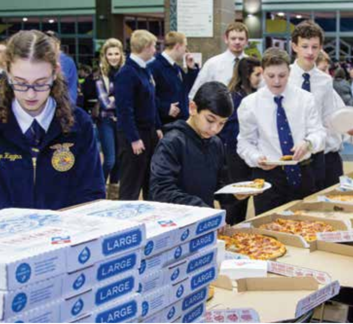
Domino's fed FFA members from various high schools in Michigan during the regional FFA leadership contests.