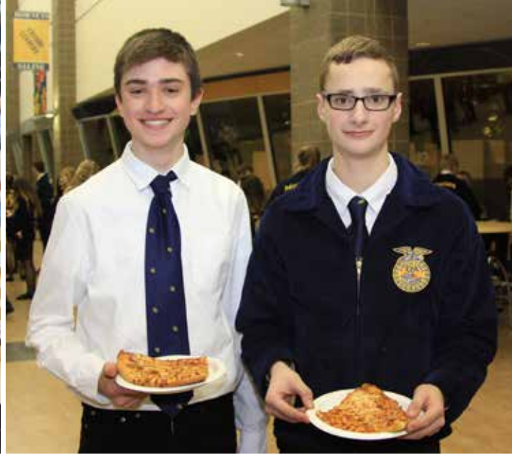
Members of the FFA chapter in Saline, Michigan, enjoyed pizza during National FFA Week in February 2017.