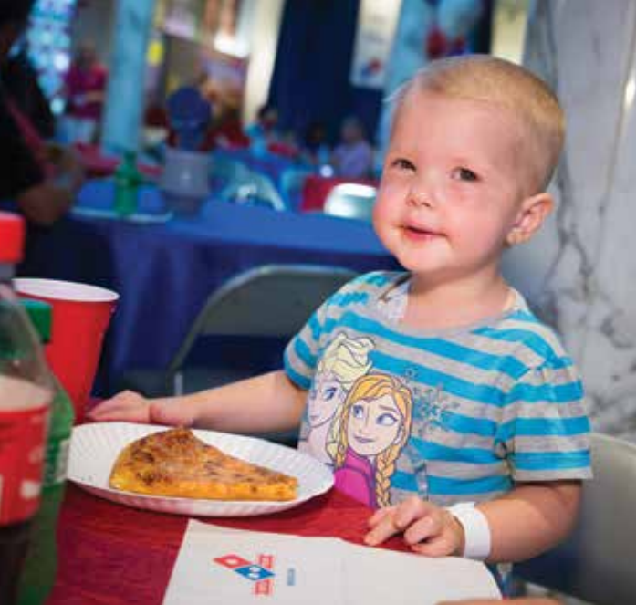
St. Jude patients enjoyed a pizza party with Domino's managers at the hospital in July 2017.