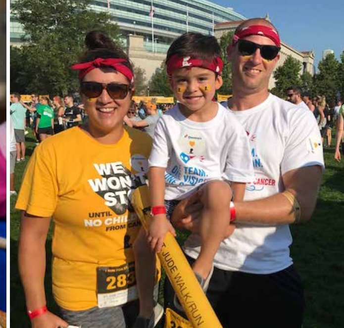
A team member and his family represented the Domino's national team at the St. Jude Walk/Run to End Childhood Cancer in Chicago.